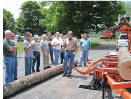
A Vendor at Last Year's Workshop Giving a Sawing Demonstration

NCSU Wood Products Extension Attn: Joe Denig Campus Box 8003 Raleigh, NC 27695 Phone: 919-515-5582 email joe_denig@ncsu.edu Workshop Date = 4-5-2011